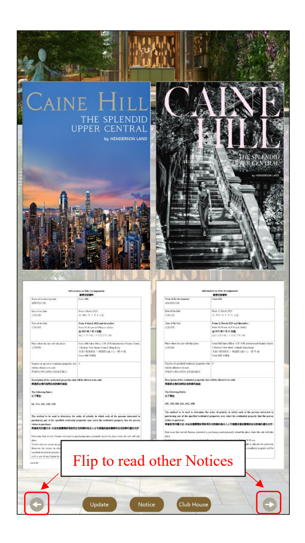
Figure 17: Notice split screen flip pages

When the number of Notices is more than 4, you can click the left and right button buttons at the toolbar to flip the page.