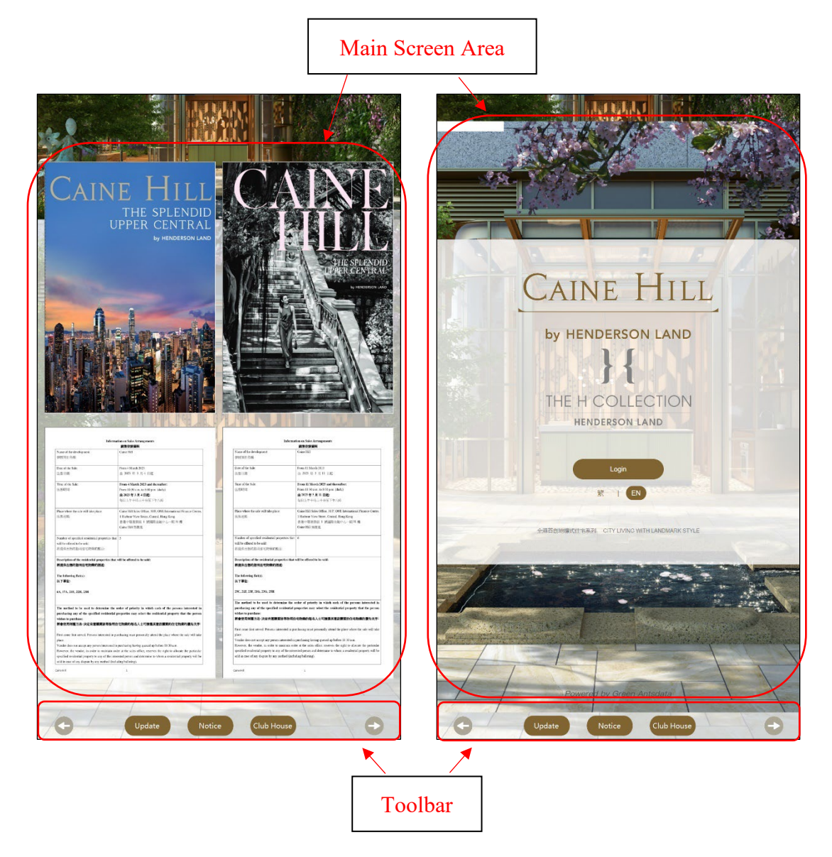
Figure 14: Terminal interface

The LCD display is divided into two functional areas: The Main Screen Area and The Toolbar .